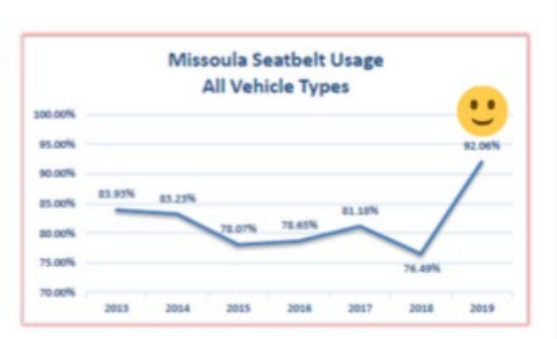
After 3 years of targeted "Buckle Up In Your Truck" campaigns, rates are up over 20%!

Pickup Seat Belt Usage 2017 71.00% 2018 71.45% 2019 86.36%